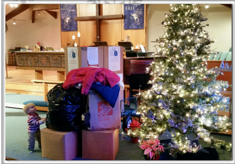
Cross of Christ Youth collected 141 coats for the Bellevue Kids Care Coat Drive!

And my second thought is how blessed I am to serve with you and how excited I am for the year ahead. In our first year plus together, we've gotten to know each other, and we've forged a partnership committed to reaching out even more to be a good neighbor in our